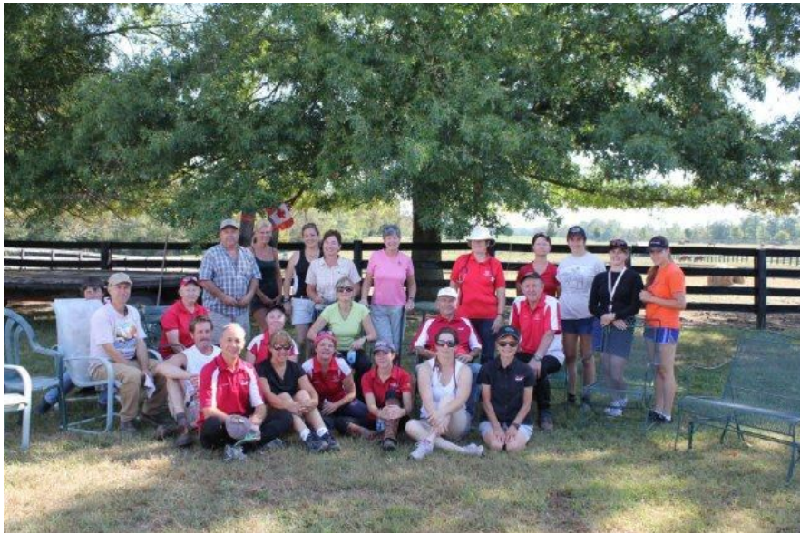
WEG 2010 Layover Barn