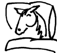
Sharon's Cozy Horse Creations