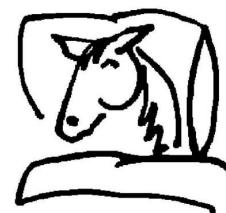
Sharon's Cozy Horse Creations